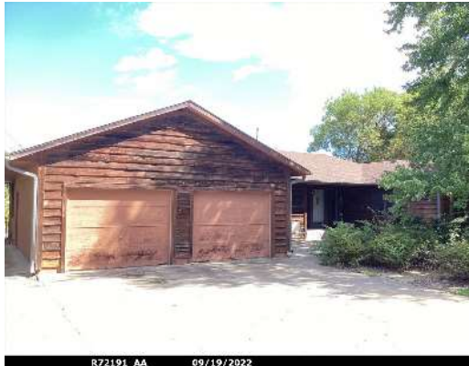
R72191_AA 09/19/2022 Image Date: 09/23/2022

S21 , T13 , R15 , S 1/2 S 1/2 NW 1/4 SW 1/4 LESS ROW